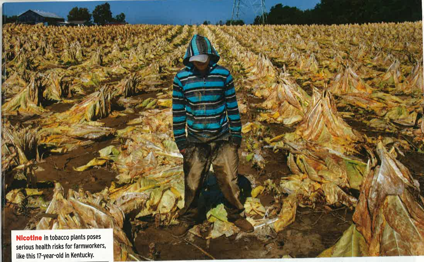
Nicotine in tobacco plants poses serious health risks for farmworkers, like this 17-year-old in Kentucky.

and called her “princess” and “baby.” Most tobacco farms, she says, have no bathrooms, and she can’t make herself go in the woods, as other women do.